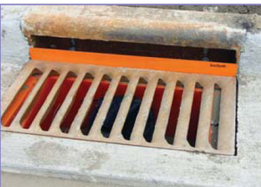
A street view and the inside of one type of inlet protection device.

Special care should be given to street inlets, as they are a direct conduit to local waterways. Inlet protection should be the last line of defense for protecting local streams and surface water.